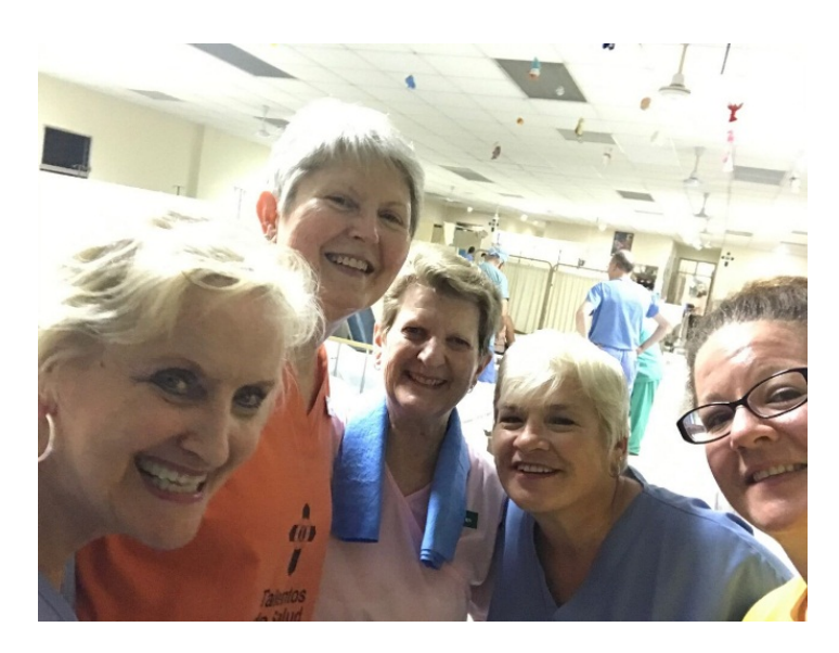
While we enjoy good times with our patients, we never want to forget the spiritual aspect.